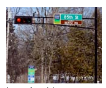
85th Street, formerly known as Bentz Road, was originally named for property owners living along the road. Descendents of the Bentz family still live along the road today.

As part of the installation of traffic signals at the intersection of Cooper Road and 85th Street, a new style street name sign was placed at the intersection. The new style sign displays the current street name, along with the historical name for the street. As new and replacement street signs throughout the Village are needed, the Village has plans to install additional historical signs. \square